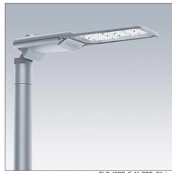
TLG ISRP F M PDB SIL.jpg