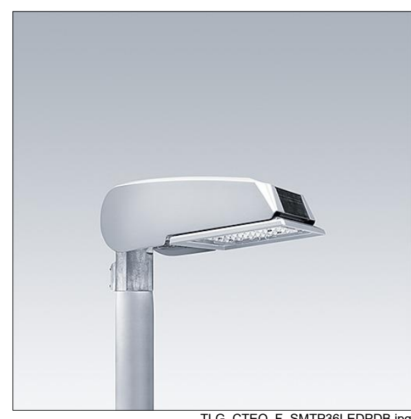
TLG CTEQ F SMTP36LEDPDB.jpg

Weight: 6.08 kg Scx: 0.077 m<sup>2</sup>