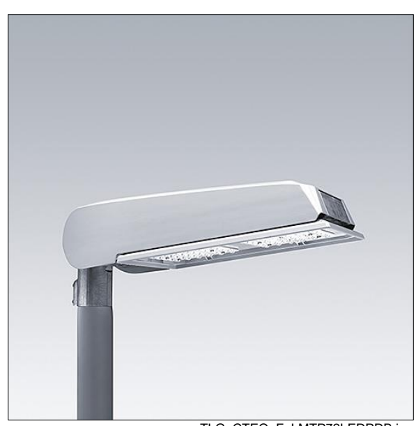
TLG CTEQ F LMTP72LEDPDB.jpg

Weight: 8.91 kg Scx: 0.115 m<sup>2</sup>