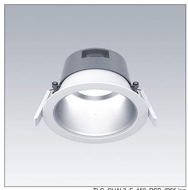
TLG CHAL3 F 150 RSB IP65.jpg