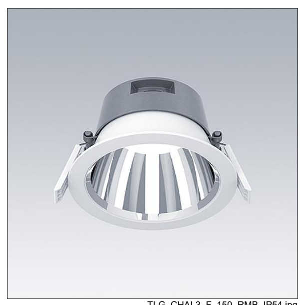
TLG CHAL3 F 150 RMB IP54.jpg