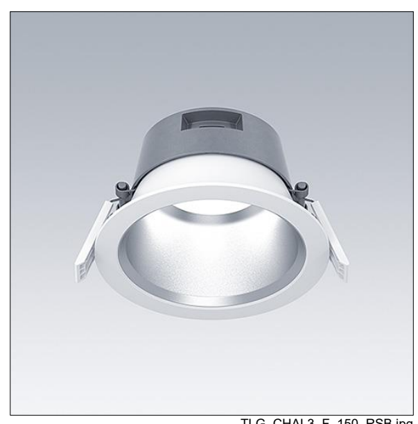
TLG CHAL3 F 150 RSB.jpg