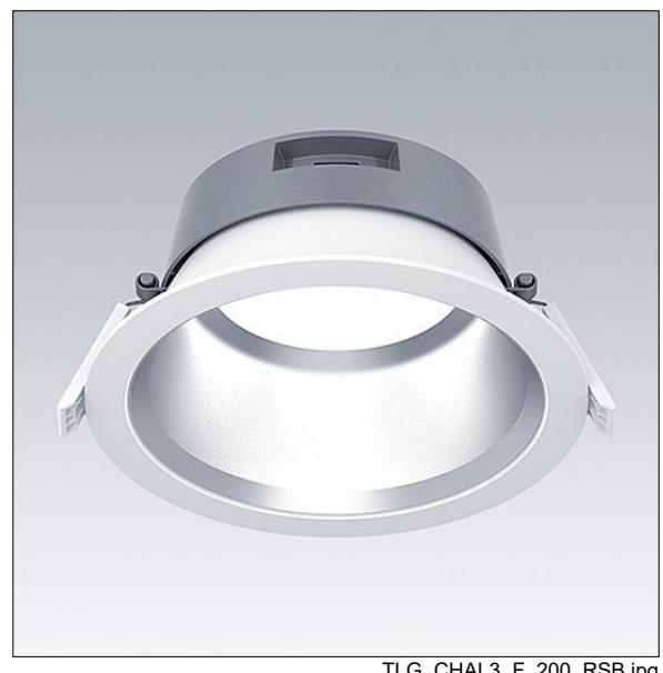
TLG CHAL3 F 200 RSB.jpg