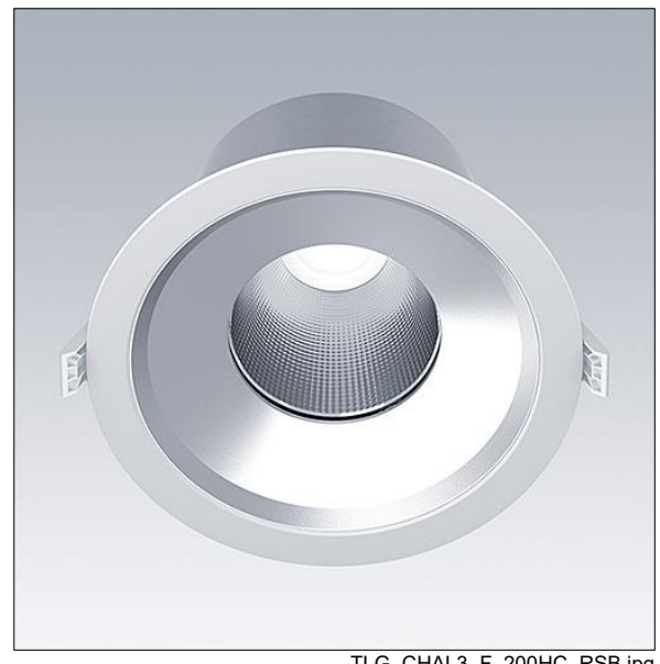
TLG CHAL3 F 200HC RSB.jpg