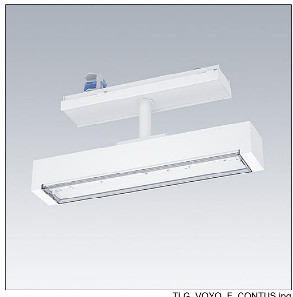
TLG VOYO F CONTUS.jpg