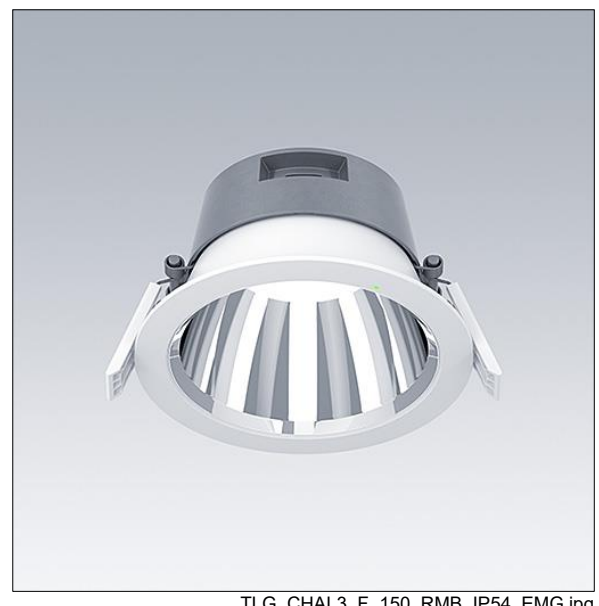
TLG CHAL3 F 150 RMB IP54 EMG.jpg