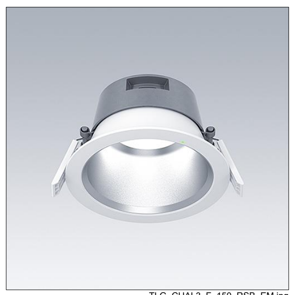
TLG CHAL3 F 150 RSB EM.jpg