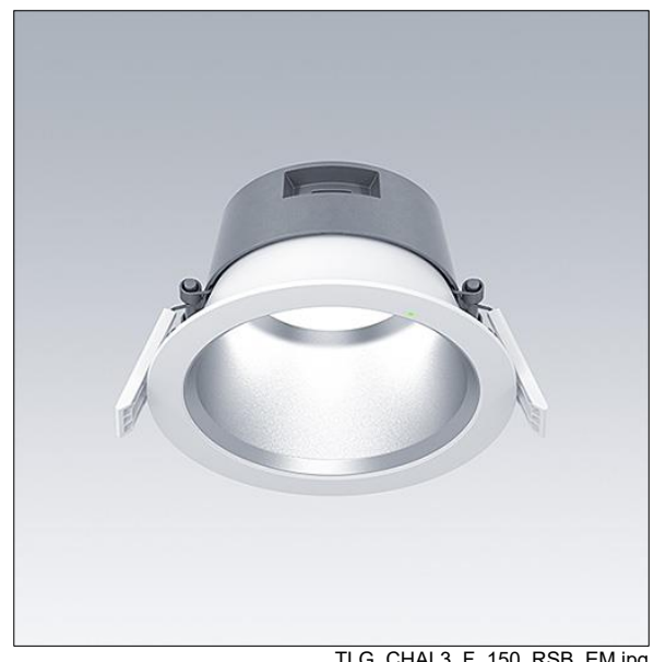
TLG CHAL3 F 150 RSB EM.jpg