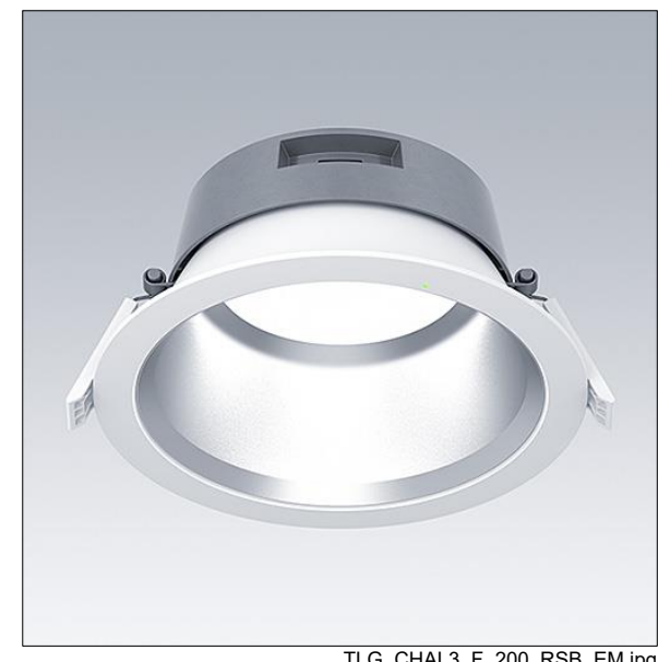
TLG CHAL3 F 200 RSB EM.jpg