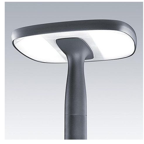
Photographs, line drawings and photometric data are representative only. For specific product detail please select an individual product.